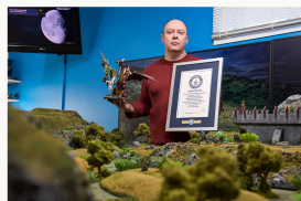
Guinness World Records

If you've been waiting on your chance to break a world record, now's your time to shine. Guinness World Records is turning 70 and celebrating by releasing 20 unclaimed records that anyone can attempt. Highlights include fastest 400-meter sack race, farthest distance bottle flip and most high dives in 30 seconds.