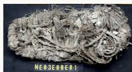
Isaac Agudo Pires, CC BY 4.0

Scientists in Spain rappelled into a cave and discovered a hoarded vulture nest that was basically a 650-year-old antique shop. The birds had been collecting treasures for generations , including ancient sandals, tools, a carved goat horn and even a crossbow bolt—apparently vultures have very eclectic taste in home decor. The perfectly preserved artifacts are now helping researchers understand the region's history, proving that one bird's trash really is an archaeologist's treasure.